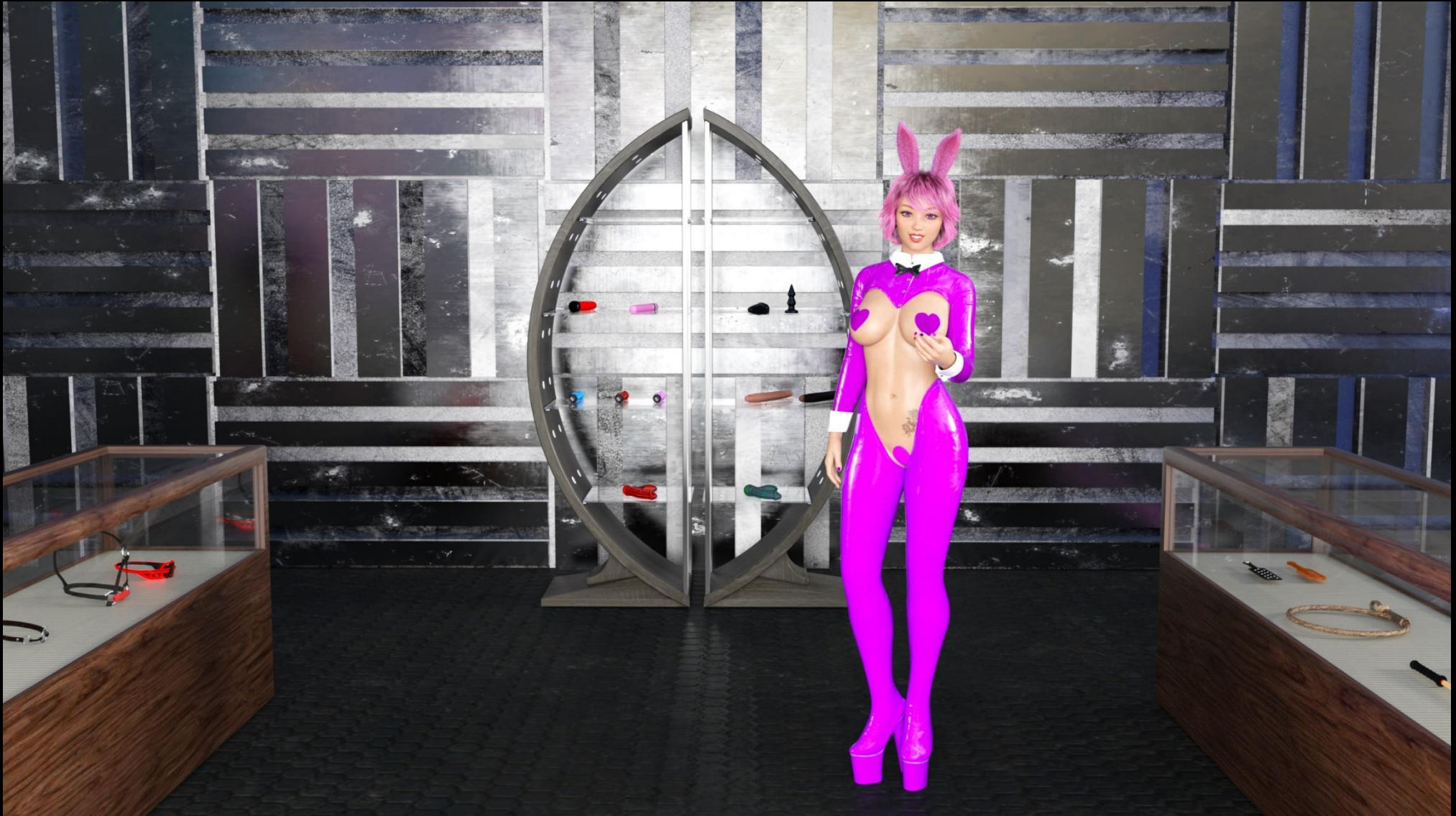
Tara led the way into the back, stopping among a number of display cases and turning to face their clients.