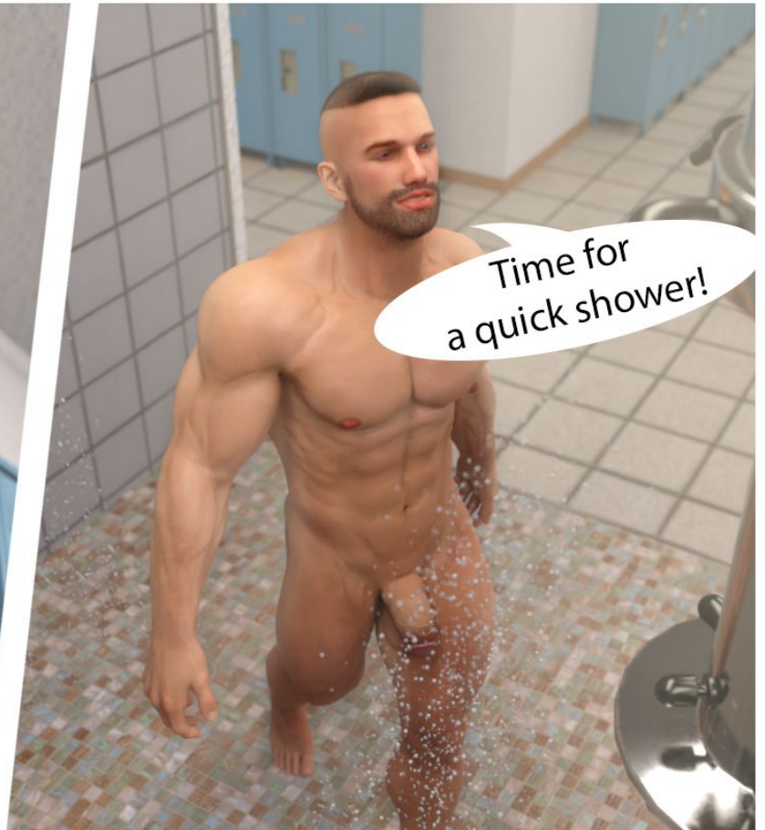
Time for a quick shower!