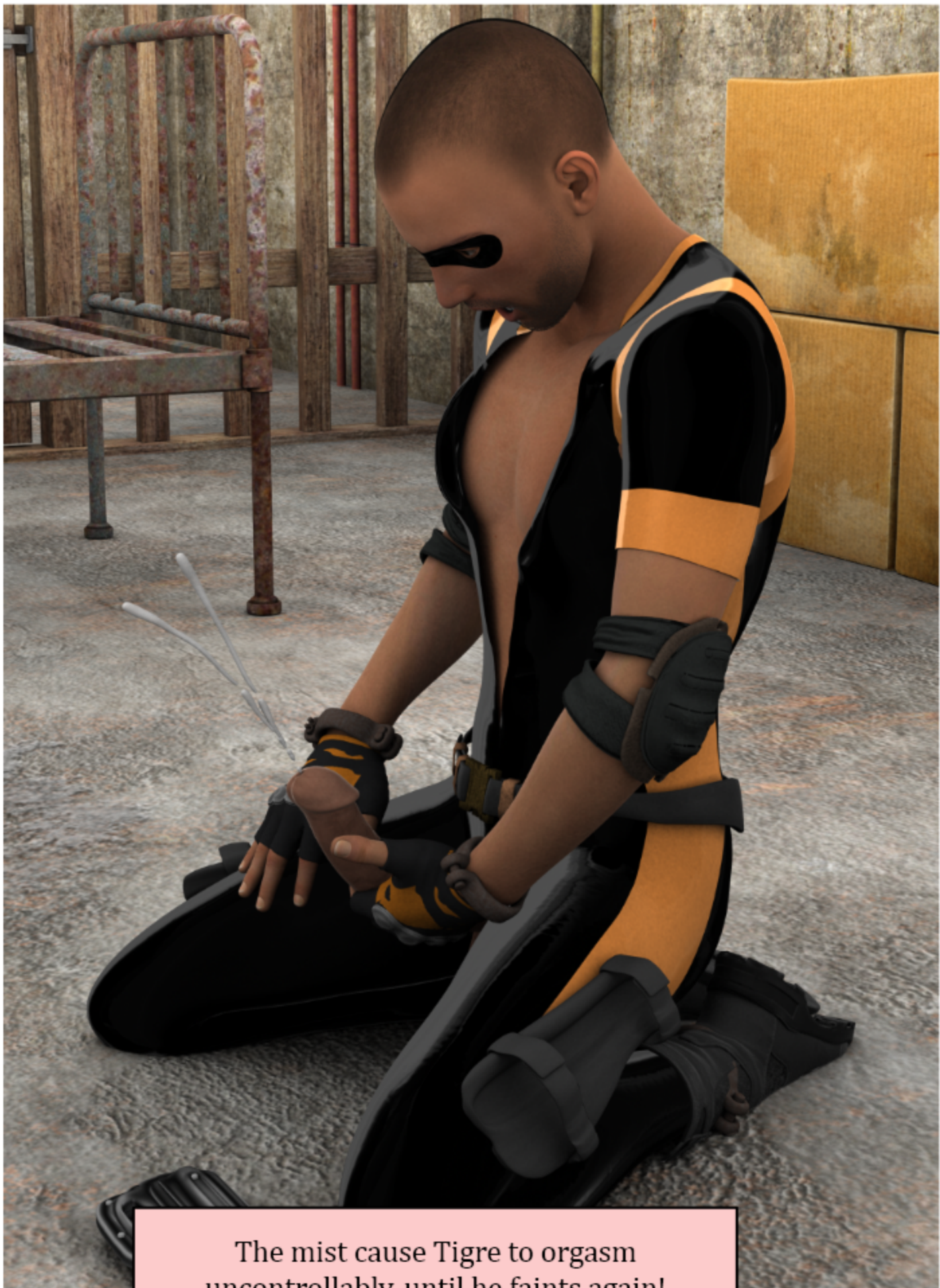
The mist cause Tigre to orgasm uncontrollably, until he faints again!