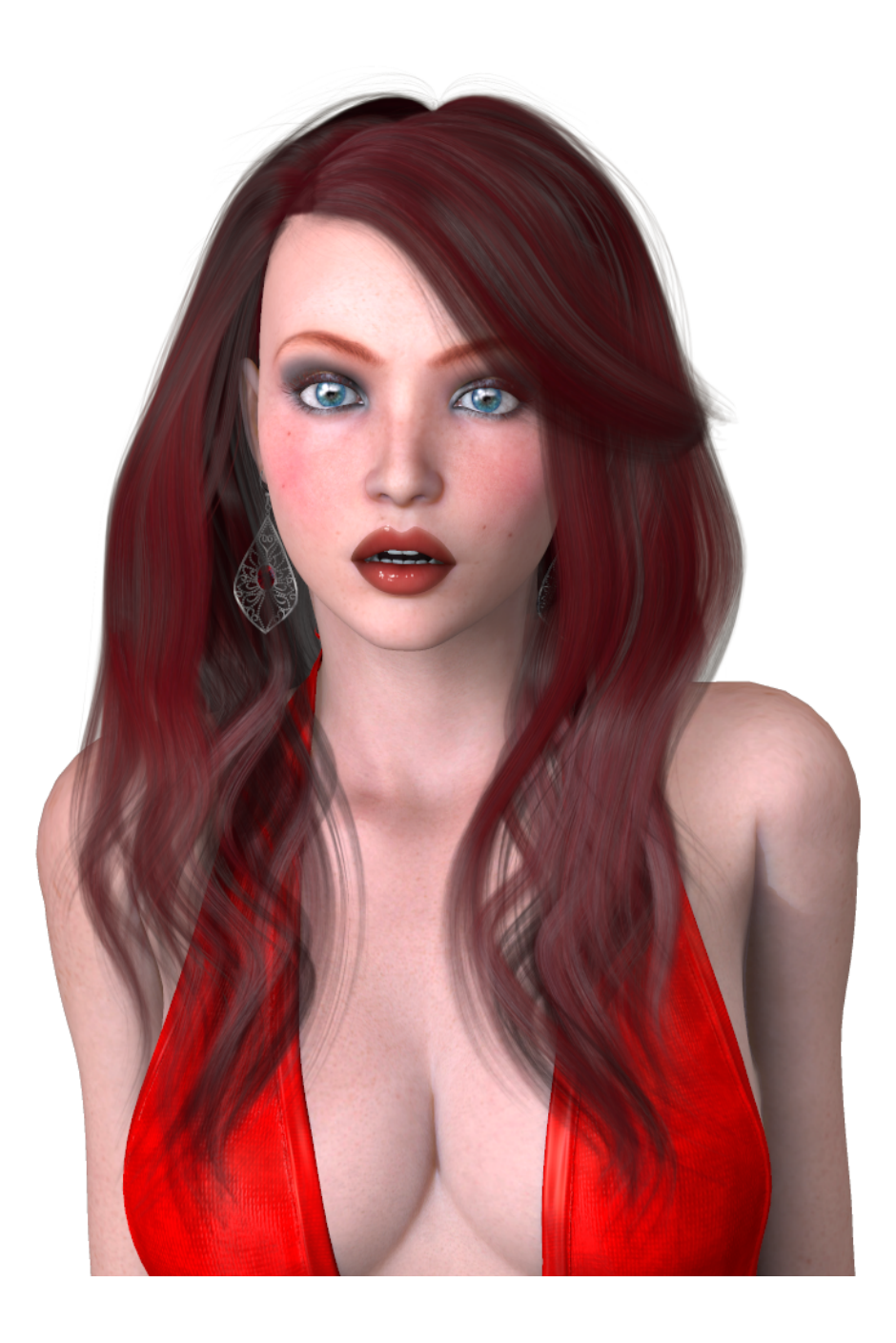
Gosh, look what they did to me! With these hair extensions and dramatic makeup, I not only look like a girl, but a fucking hot one! And this dress they forced me to wear...