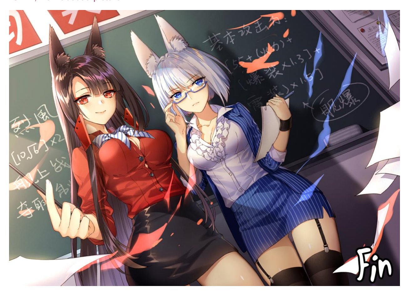
"Umm, How about a picture?"