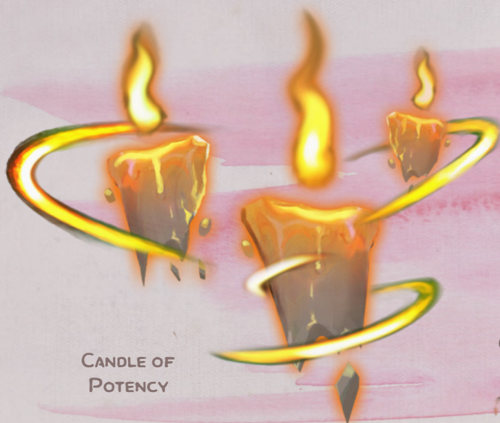
CANDLE OF POTENCY