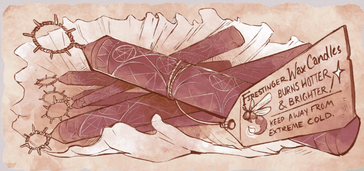
HANDOUT 1. FIRESTINGER WAX CANDLES

When a wax elemental (see Wax Elementals sidebar on page 13) takes fire damage, its attacks deal extra fire damage. In addition, the Pontiff's Heated Body trait deals extra damage. To communicate this, narrate that a wax elemental catches aflame upon taking the fire damage, burning hot and bright. At the end of its next turn, these flames are extinguished and it returns to normal. Characters who see Jandar's candle instantly recognize that the golems in The Battle Ahead (pages 8 – 16) are made from the same wax that the firestinger bees produce.