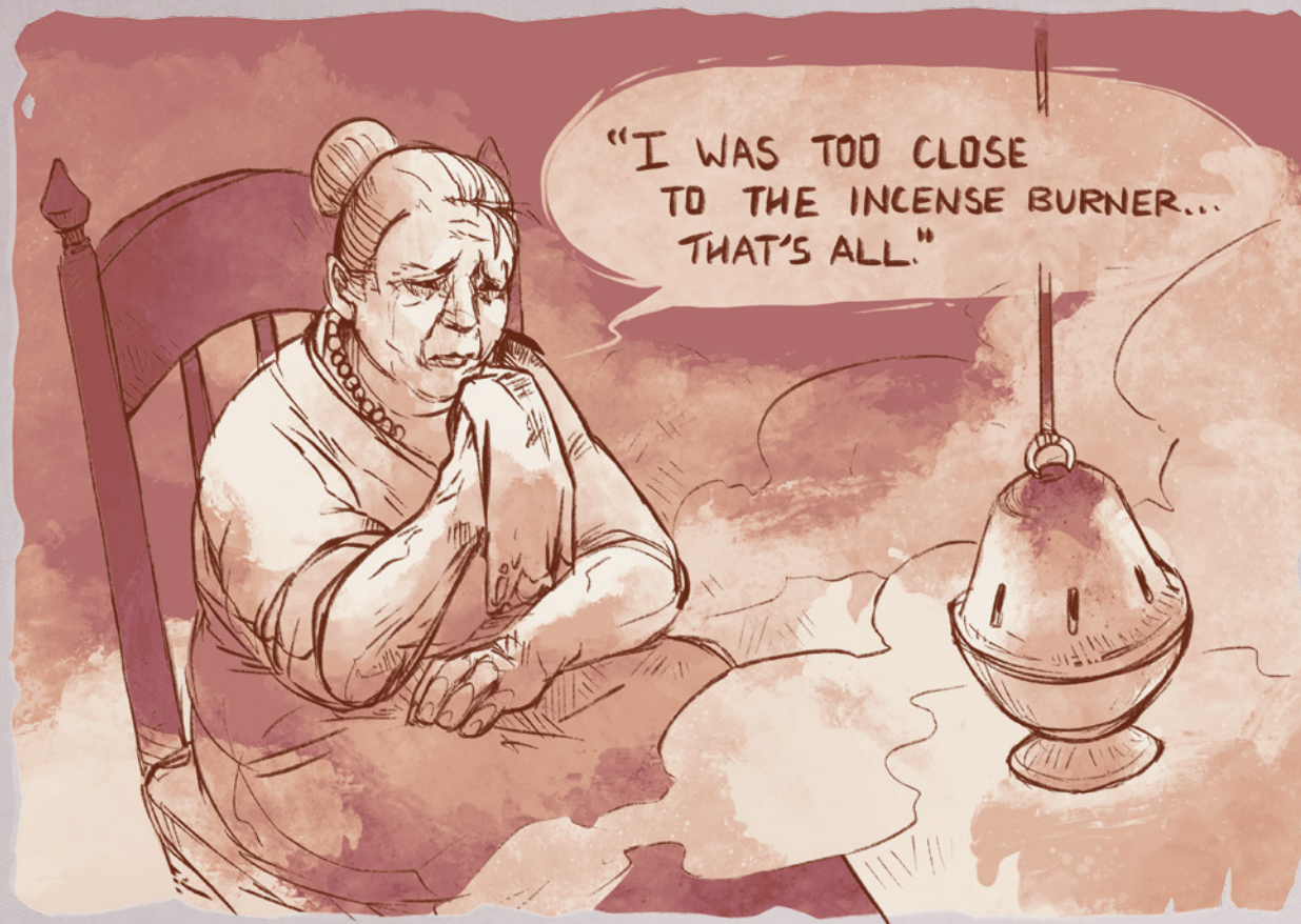
HANDOUT 2. INCENSE EXPOSURE