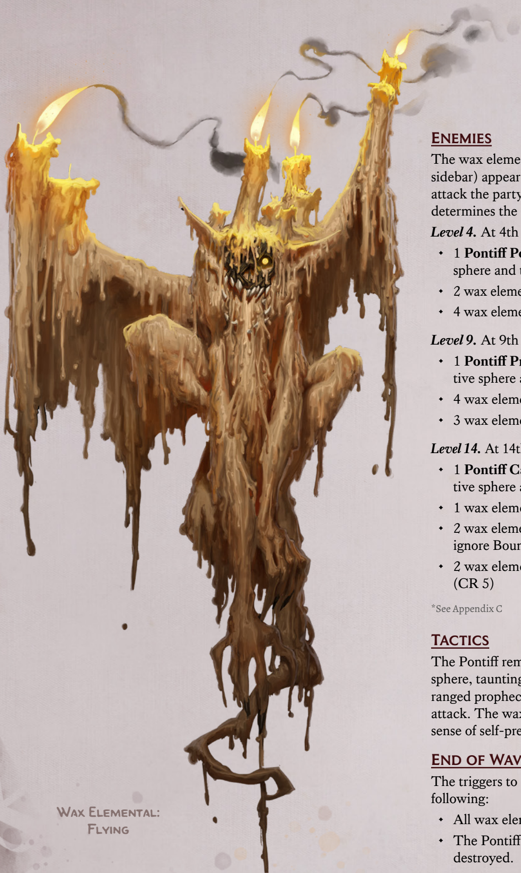
WAX ELEMENTAL: FLYING