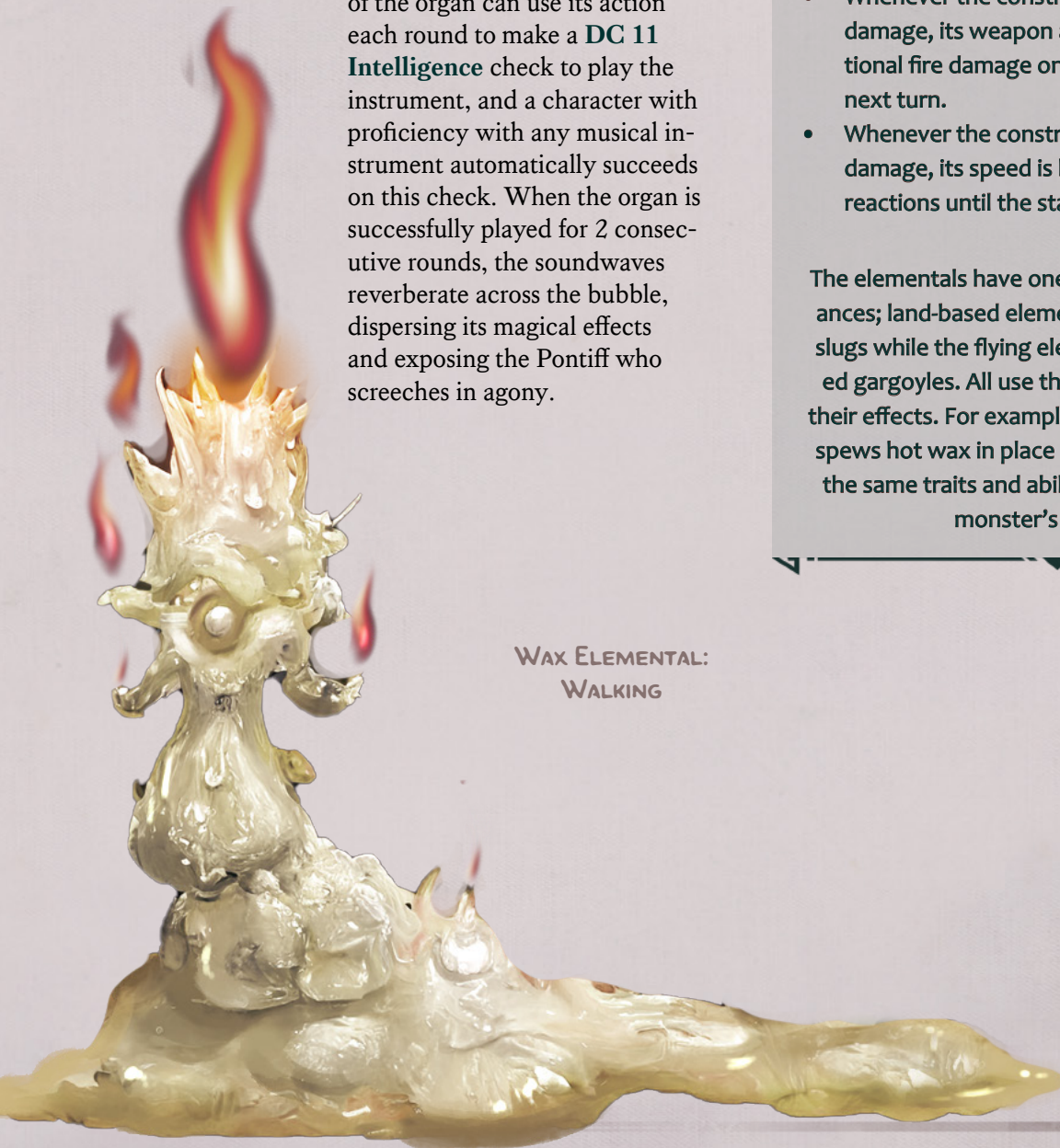
WAX ELEMENTAL: WALKING

The elementals have one of two molten appearances; land-based elementals appear as waxen slugs while the flying elementals look like melted gargoyles. All use their wax body to create their effects. For example, a wax magma mephit spews hot wax in place of fire. It otherwise has the same traits and abilities as the referenced monster's statistics.