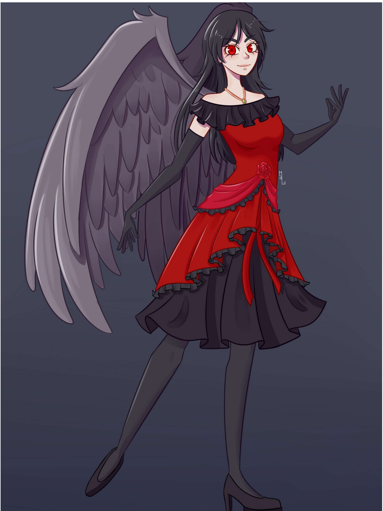
Ina today (2054 Inaverse)