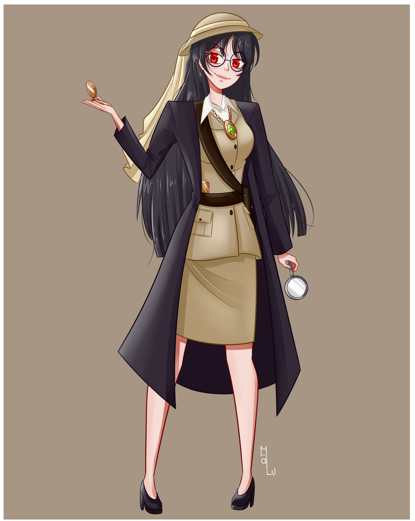
Karenina at the moment in which she will travel between universes