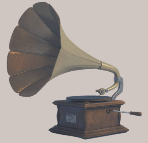
https://open.spotify.com/play list/7IPgytnh5bhcKwIOC5w guX?si=962d8024a19b4653