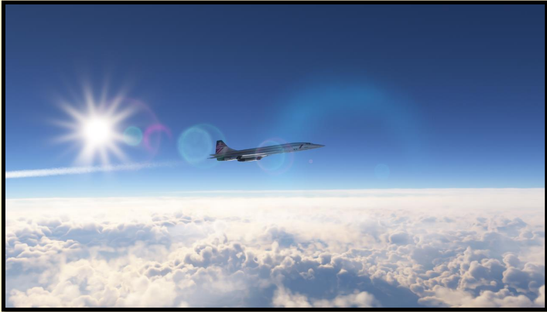
The DC Designs Concorde, super-cruising at Mach 2.01 at 58,000ft

“Concorde won’t reach Mach 2! It climbs for a while, then stalls and crashes!”