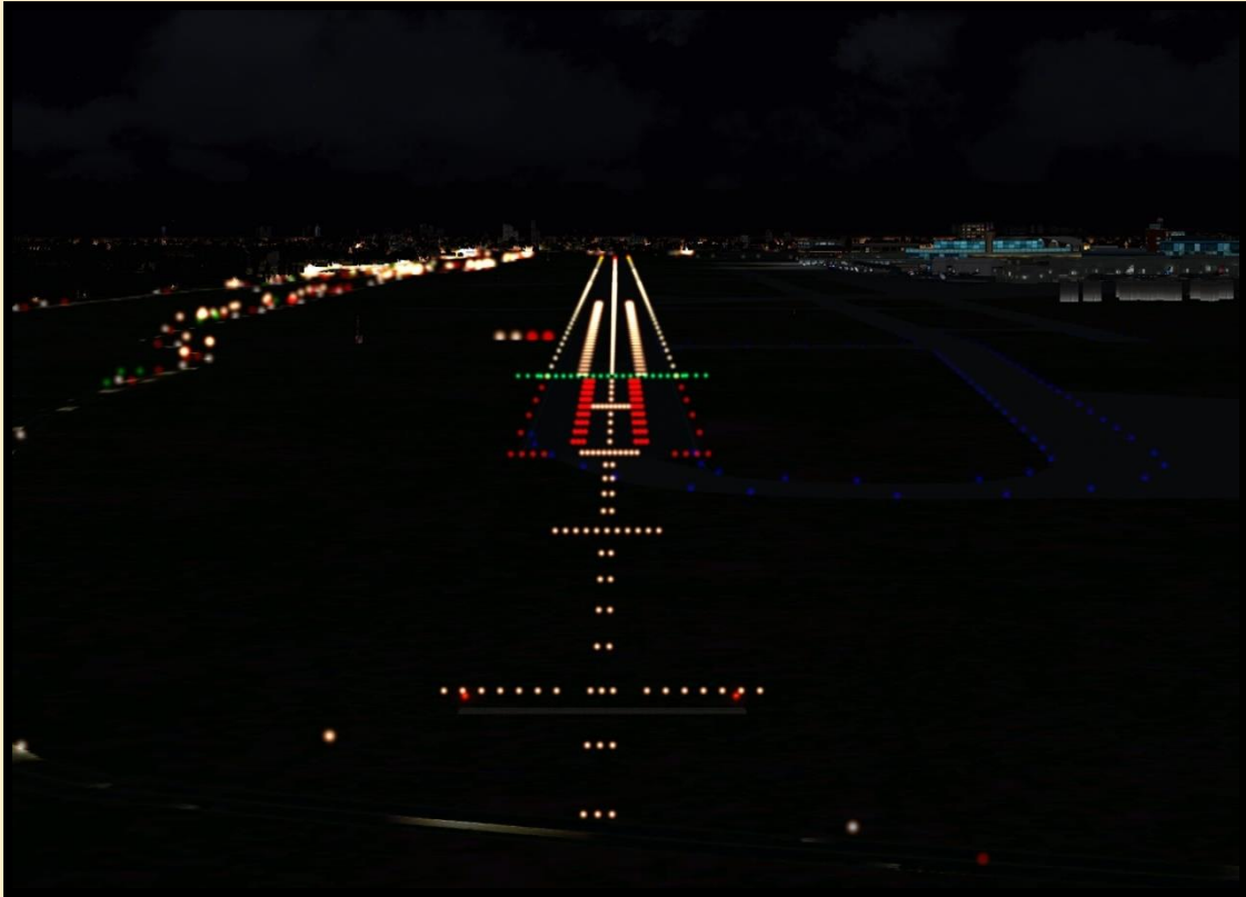
Airfield PAPI lights to the left of the runway, showing two green and two red lights – our hero is on the glideslope, right where they should be

Most airfields will have PAPI lights, a row of four high-intensity lights to the left of the runway threshold. If you're on the correct glideslope, you'll see two reds and two greens ( sometimes two reds and two whites ). Too high, you'll see all greens. Too low, all reds. Use your throttle in the approach to keep those two reds and two greens, and be the envy of all simmers wherever you fly. Power up to reduce your descent rate, power down to increase it.