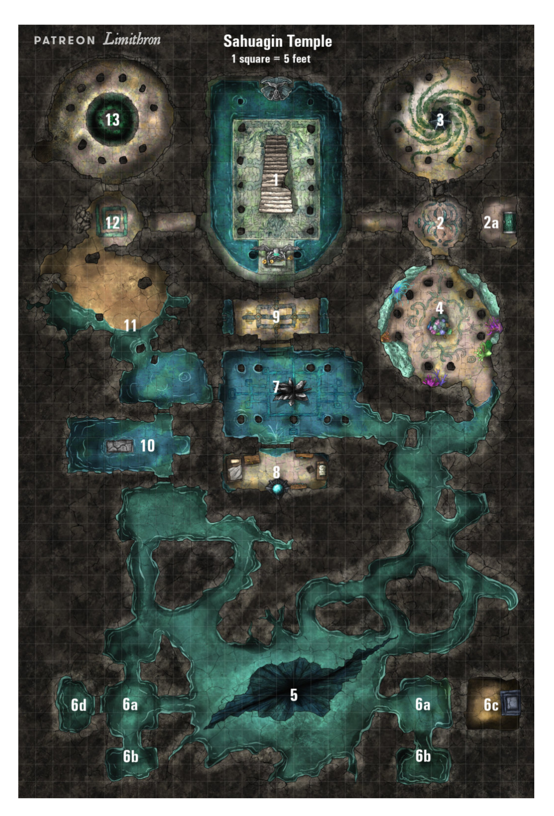
Dungeons & Lairs #74 - Sahuagin Temple